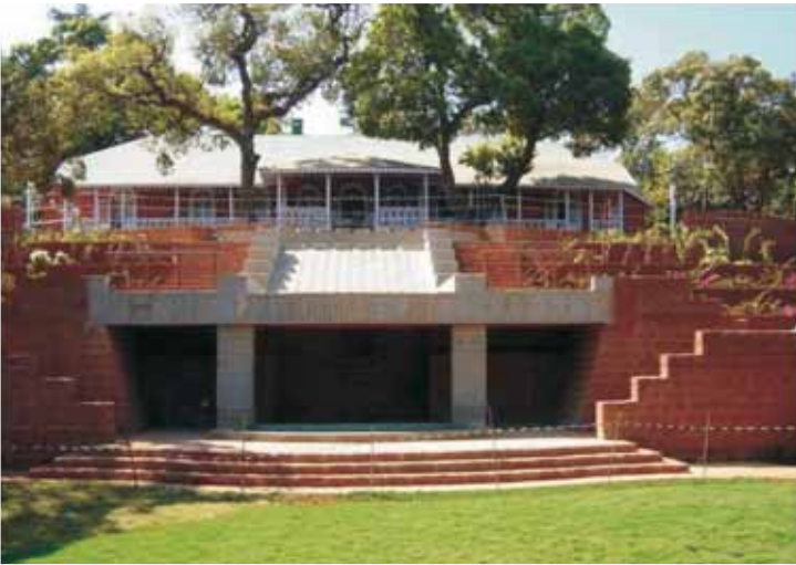
Highlights : ■ Level Difference of 15m. ■ Extensive use of hand dressed laterite, rough shahabad, polished shahabad, glass mosaic Water body with sheet screen fall.