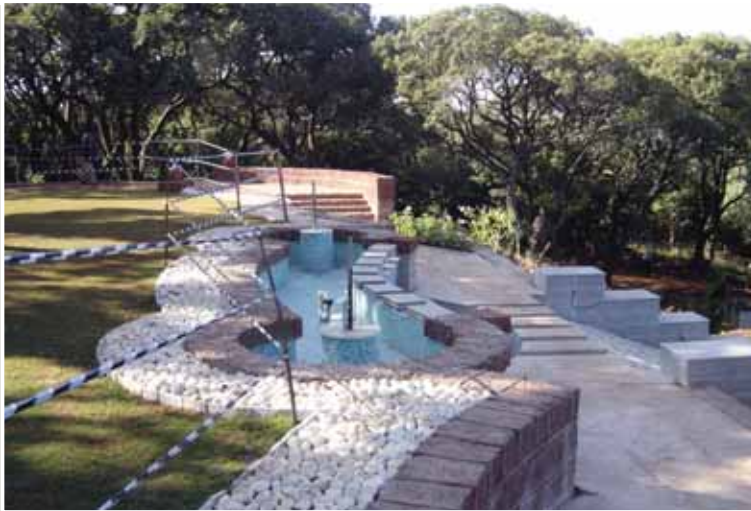
Farm House Landscape At Mahabaleshwar. Architect : Ravi Varsha Gavandi, Pune. Landscaped Area : 5 acres. Duration : 8 months