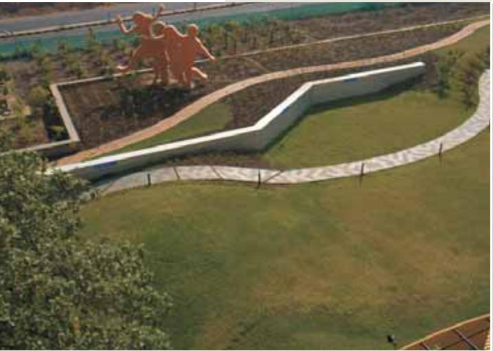
Highlights : ■ Underground meditation hall with granite clad water body and roof in polycarbonate water trough with glass mosaic. ■ Ferrocete screen wall with Pergola. ■ Pathways in wirecut bricks,cudappah and vitrified tiles. ■ Granite cobbles and fabricated structure for entrance canopy.